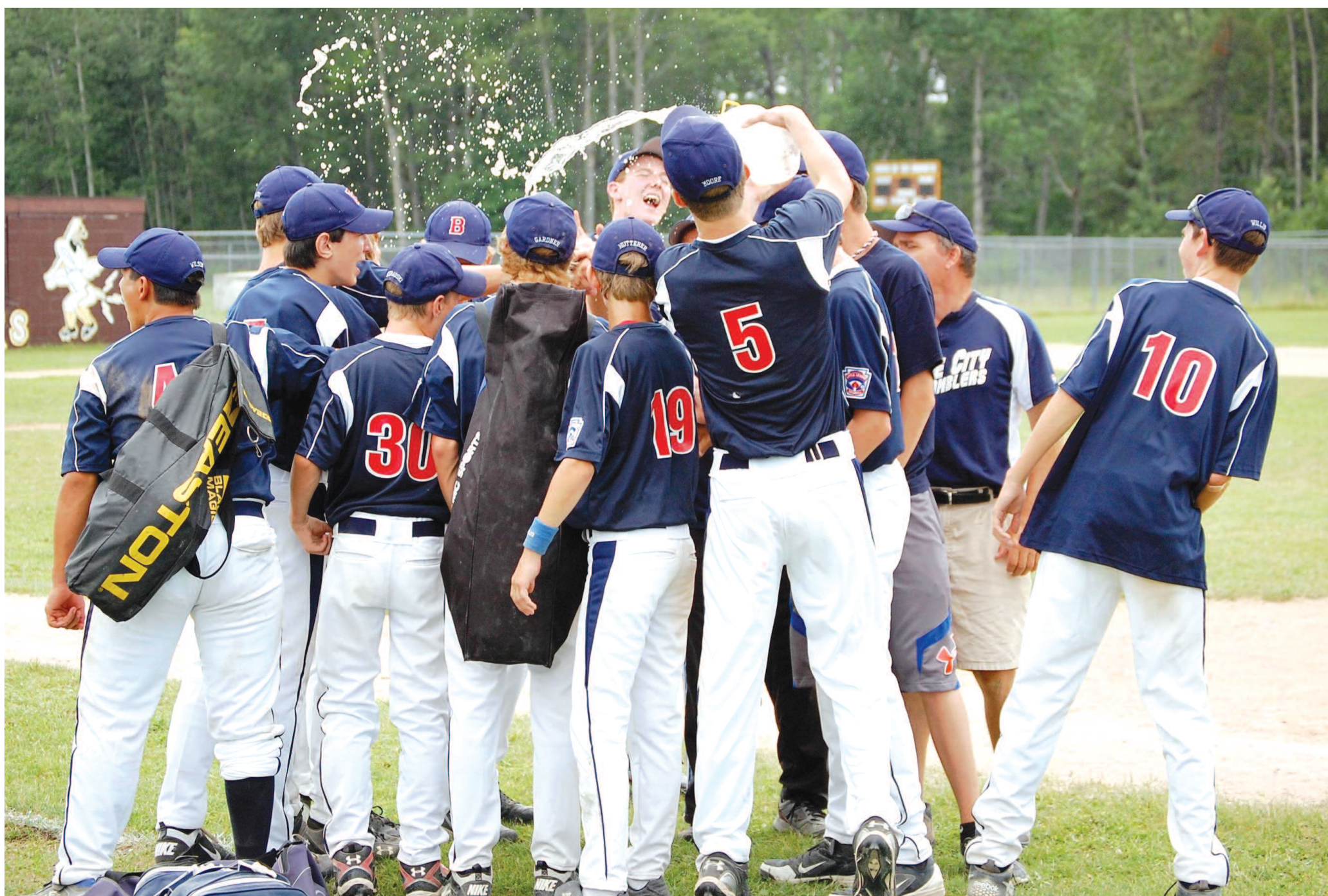
The Boyne City junior Little League All-Stars celebrate following their 8-7 victory over Sault Ste. Marie in sectional play, thus advancing to the State Finals.